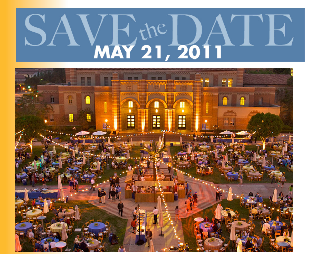
Mark your calendars for UCLA Alumni Day 2011

Plan now to come to UCLA and hear alumni from Disney, LA Dodgers and other corporate giants discuss creativity, innovation, team-building and developing winning strategies.